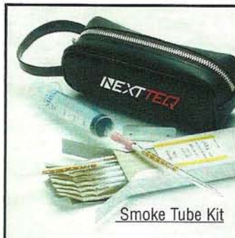
Smoke Tube Kit

THE PROMISE: You can trust Gastec components. The accuracy is in the system. Gastec tubes and pumps are designed, manufactured, and calibrated to work together. Only authentic Gastec components offer this assurance of quality. More than 30 years of manufacturing experience goes into every Gastec tube and pump, manufactured under the ISO 9001 certified quality system. Call today. Join the thousands of health and safety professionals who trust in Gastec.