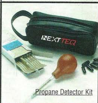
Propane Detector Kit

What's next? → A New Name: Straughan Technical is now