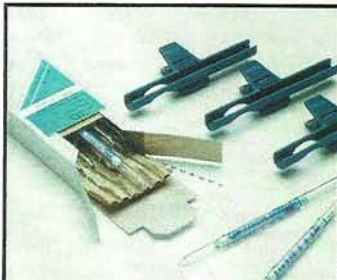
Dosimeter Tubes and Holders